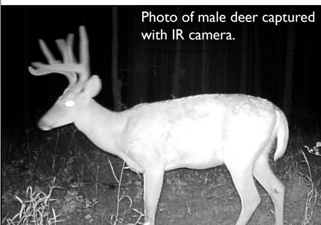
Photo of male deer captured with IR camera.

The Park's deer population is slowly rising as indicated by the trend line in the chart and the fact that our current population is higher than 2001. This observation is even more noticeable when you factor in that over 600 deer have been removed over those 14 years via the deer management program and countless others through deer vehicle collisions and emigration. Over the past five years, the archery harvest numbers have plateaued. Acreage designated to the archery program has climbed from 280 acres in 2011 to 725 acres in 2016. These facts prompted staff to search for more options to reduce the deer herd as soon as possible. Recent meetings between HMP staff and FCPA staff running the deer management program have resulted in several benefits for the Park. Huntley Meadows is being added to the sharp-shooting schedule again in 2016-2017 after a 2 year absence, and there is a future commitment to conduct annual sharpshooting in the Park