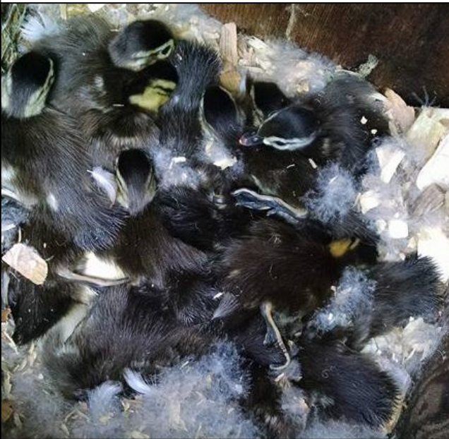
Wood Duck hatchlings in nest box.

The Huntley Meadows Monday Morning Birdwalks this spring have been extraordinary. In May alone, records for species heard and/or seen and number of birders were broken. The number of migratory species broke long standing records for the Monday Morning Birdwalk. On May 2, the group tallied 85 species with about 15 Warbler species. After word of that got around, we drew 50 birders the next week who were not disappointed. The species count that day was 90, with almost 20 Warbler species counted. We were most impressed with the migrating Warbler abundance. Many birders added to their life lists with Hooded Warblers, Wilsons Warblers , Yellow-throated Warblers, and many more. On May 9 we spotted several Thrush species: Wood, Swainson's, and Veery. Although we had fewer birders on May 16, 78 species were tallied.