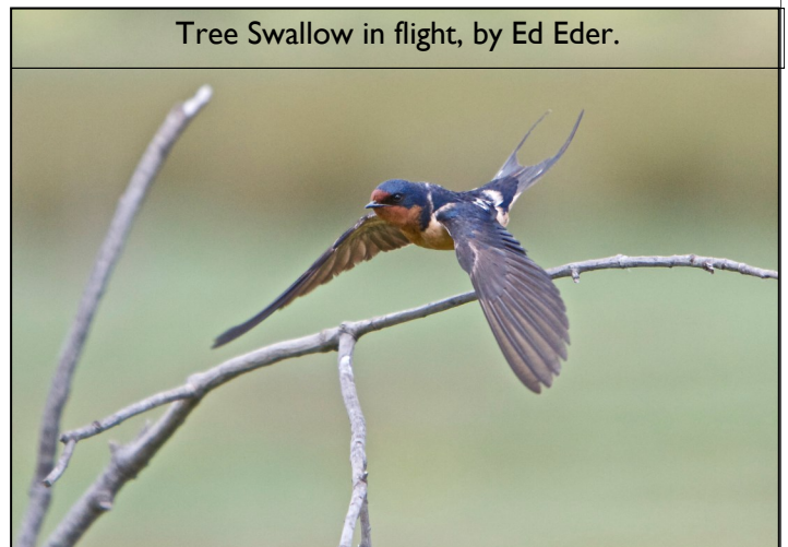
Tree Swallow in flight